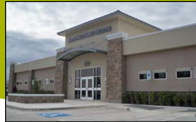
NORTH HILLS FAMILY PRACTICE