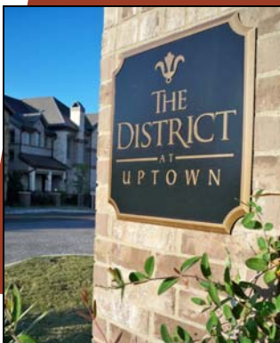
KELLER TOWN CENTER UPTOWN