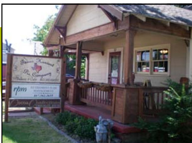
TEXAS HARVEST PIE COMPANY