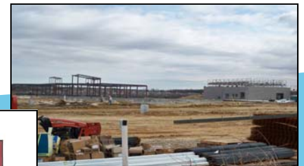
KISD ELEMENTARY SCHOOL CURRENT CONSTRUCTION