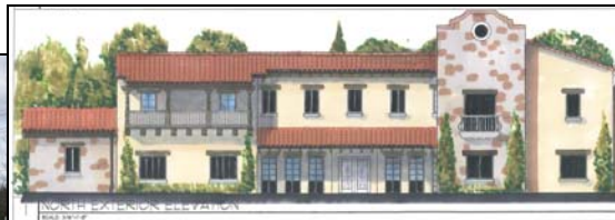
SALONS OF VOLTERRA NORTH ELEVATION