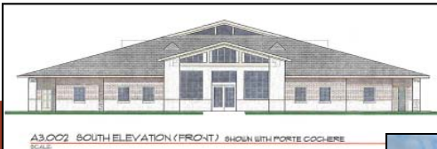
PINNACLE MONTESSORI SCHOOL SOUTH ELEVATION