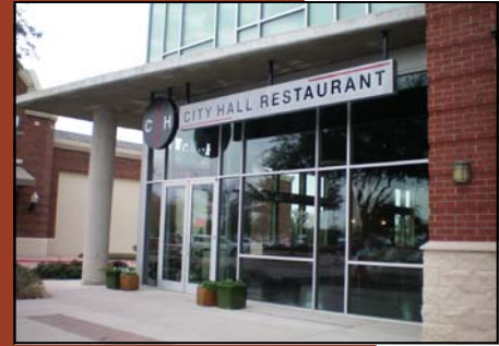
CITY HALL RESTAURANT