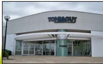
TONI & GUY HAIRDRESSING ACADEMY