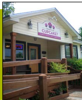
WHAT'S UP CUPCAKE