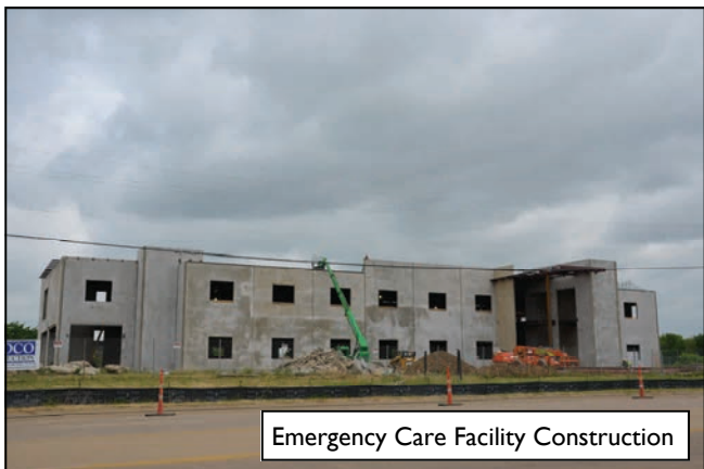
Emergency Care Facility Construction

Just up Main Street, construction is also moving along on Emerus Advanced Emergency Care, a 37,759-square-foot emergency medical facility affiliated with Baylor Regional Medical Center at Grapevine. In addition to providing additional medical services to area residents and workers, Emerus helps fill an important need in Keller: daytime population generators.